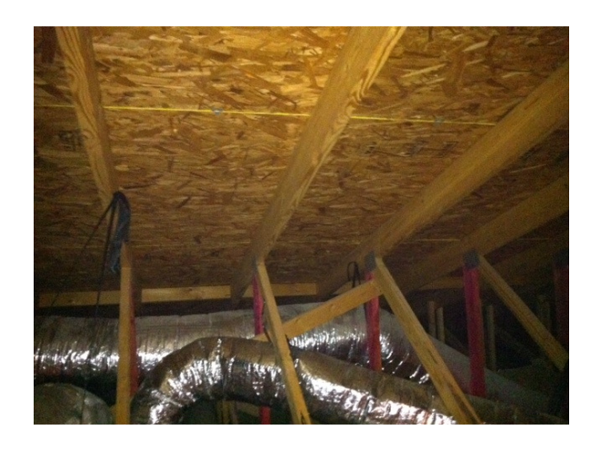
Attic with no radiant barrier protection