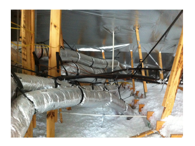
Rafter-applied sheet radiant barrier