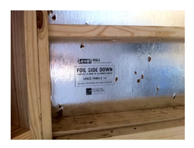
OSB decking with radiant barrier